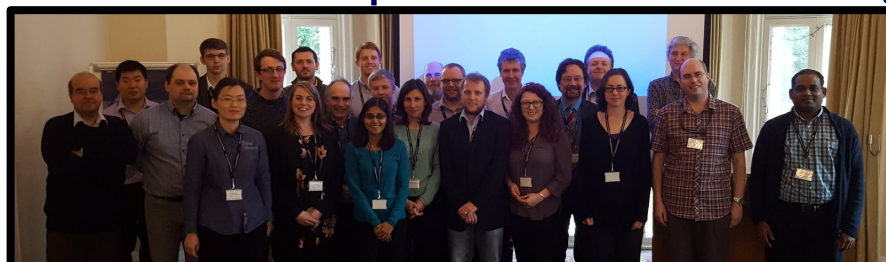
First plenary Indo-UK conference, Sheffield, December 2016